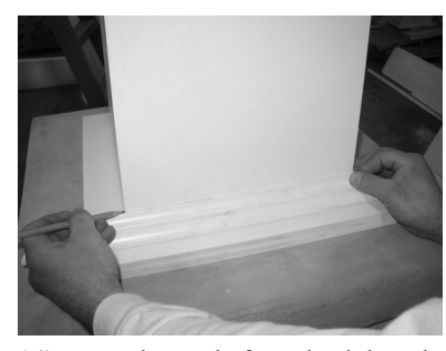
14) Use column shaft to check length of base trim molding. If trim is too long, mark cut lines for miters. Moldings should be about 1/8" longer than the width of the column.**