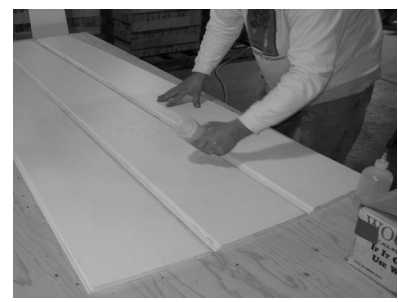
5) Lay 3 panels flat and apply adhesive to center joints. (Polyurethane glue is recommended. Follow manufacturer's instructions.)