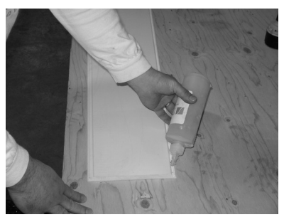
11) Apply adhesive to final panel.