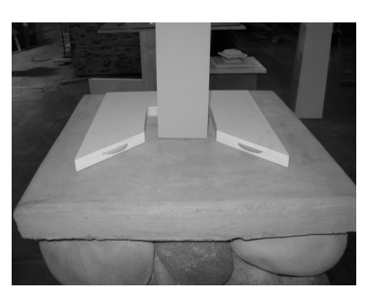
3) Slide <sup>3</sup>/<sub>4</sub> cut base platform section around post.