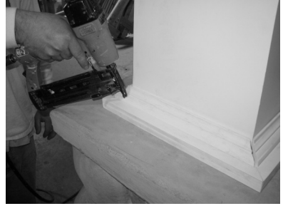
16) Center trim moldings around shaft. Apply adhesive to base trim moldings and pin-nail into base platform. (Do not attach to shaft.) There should be about a 1/16" gap around shaft.