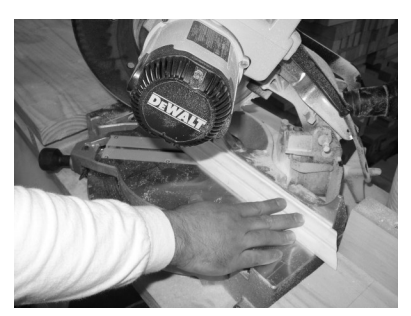
15) If base trim moldings are too long, use miter saw to cut base trim pieces to fit around bottom of column.**