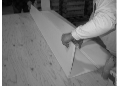
6) Assemble three panels, using E-Z Lock joints.