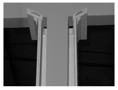
9) Slide <sup>3</sup>/<sub>4</sub> cap platform section into place on top of column panels.*