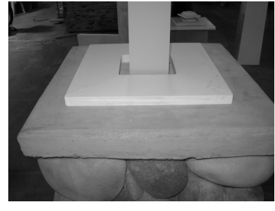
4) Glue base platform pieces using biscuits (supplied). Center and attach base to floor/pedestal with appropriate fasteners.