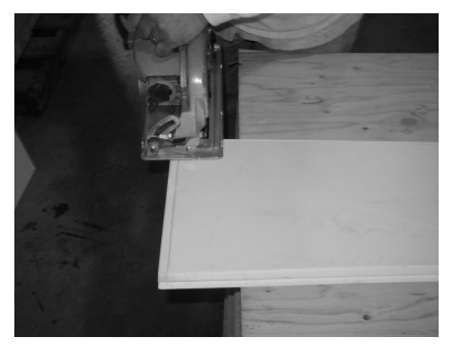
2) Trim shaft pieces to 2½" shorter than opening—2" for cap/base, ½" for expansion (½" if not using cap and base—each part is 1" thick.) Always trim from bottom ONLY-top is marked.