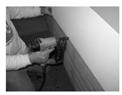
7) Finish nail three panels together.