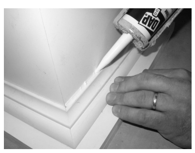
17) Caulk using latex caulking compound to fill any gaps and nail or screw holes.