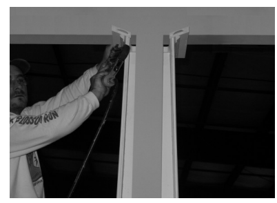
10) Raise 3/4 cap platform section to beam/soffit, center, and attach. There should be 1/4" space for expansion between column and cap platform.